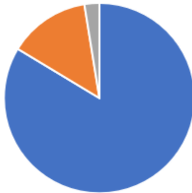
SEND at Alexandra Park Junior School

At Alexandra Park Junior School, we have 15% (52) SEND Support, 3% (9) EHC children with 89% of our school community with English as an additional language.